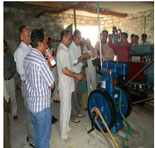
Viro Agro Processing Centre