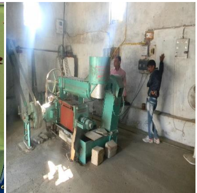
Chotila Agro Processing Centre