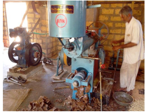
Loej Agro Processing Centre